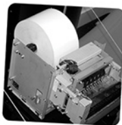
Internal 6.5" print roll