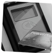
Wide variety of EMV certified terminals

Touchmate Inc. 7703 North Lamar Boulevard, Suite 100 Austin, TX, 78752 www.touchmateUSA.com