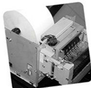
Wide range of printers