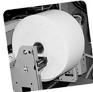
Large print rolls

Touchmate Inc. Suite 100, 7703 North Lamar Boulevard, Austin, TX, 78752 www.touchmateUSA.com